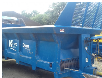
K Two Muck spreader 1000 rear discharge. guilotene door £11,650