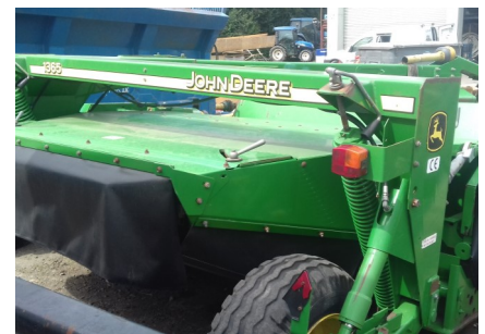
John Deere Mower 2003 Conditioner 1365 £6,500