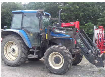
NH TS90 2003 2003 £16,500 c/w Trima 340 Loader

U Series: Mechanical self levelling. Compact Loader MX—C Series Loader Compact Loaders. Specifically designed for the amenity and grounds care tractor market for 15– 60hp